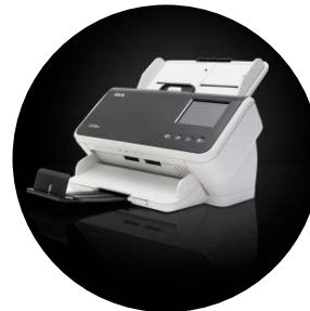
Alaris S2060w/S2080w Scanners